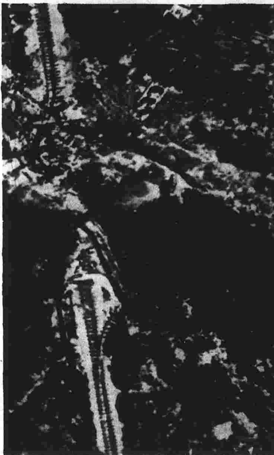
Bridge Out This United States Air Force aerial photo, released Wednesday in Saigon, shows the damaged 96-foot long Vu Chu railroad bridge hit by guided bombs June 22. The bridge, located 38 miles from Hanoi, crossed the Sui Ngang River in North Vietnam.

Jazz in Gotham NEW YORK (AP) — Ex — some famous, some not, clement bubbled and boiled as some old, some new — had just Lionel Hampton and 21 other finished Benny Goodman's musicians came "Flying Sing, Sing, Sing" with a so-called "midnight jazz" concert, exciting them many began the most exhilarated audience so far was on its feet, "flying home." He, and the second with $5,021 in per capita cheating in a jazz buff's heaven, which actually bassoon, and Cat Anderson with $4,895. Hampton and his musicians (See Page Three) We're Rich — They Say HARTFORD, Conn. (AP) — Connecticut's per capita income in 1971 was $2,002 and once again was top in the nation, Development Commission. The commission reported that New York was second with $1,921 in per capita income and Nevada was third with $1,895. Connecticut was first in the nation (See Page Eight)